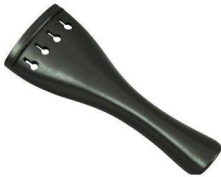
The String Centre Ebony Violin Tailpiece Ebony 4/4 Size about $5.00. Must purchase the tailgut separately

Below are some brands that I personally use, but you can buy any brand you prefer. I copied this information from Amazon.com.