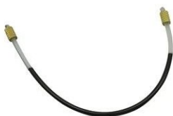
Sacconi Tailpiece Adjuster (Violin) about $3.50. This is a very strong nylon tailpiece adjuster (tailgut) Do not buy a metal tailpiece adjuster. Some tailpieces come with a tailgut.